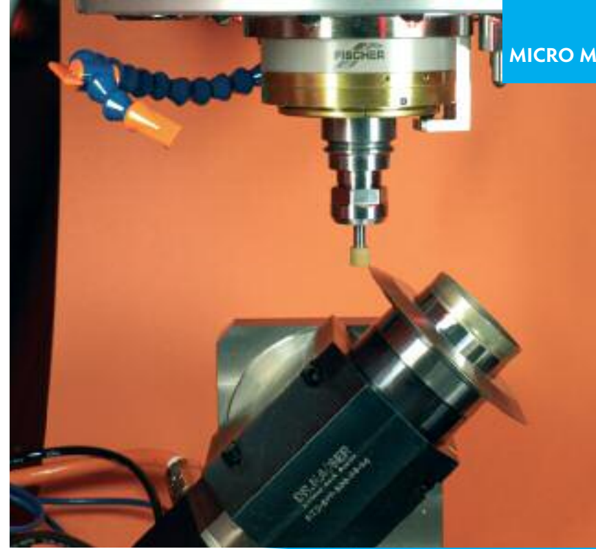
<< Figure 5: The dressing spindle can be equipped with various dressing tools and can be freely positioned for optimal dressing results. >>

Through the utilisation of rotational and parallel axes, it is possible to position workpieces so that flat grinding processes can be carried out on the machine. Kern uses this technology on its own machines to produce axis components directly on the milling-grinding centre. Due to the omission of the 'flat grinding' processing step, the throughput time as well as the processing times could be reduced while simultaneously improving the quality.