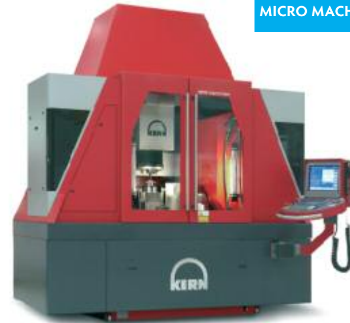
<< Figure 2: 5-axis Pyramid Nano milling centre from Kern Microtechnik. >>

During rough grinding, the sensor checks whether the tool is already in contact with the workpiece and if not, it increases the movement in incremental values until the workpiece is contacted. The successful application of the Kern Pyramid Nano for grinding processes is based on the high precision and the hydrostatics of the milling machine, supplemented by a 'grinding package' consisting of wheel dressing unit, ultrasound sensor technology and grinding software.