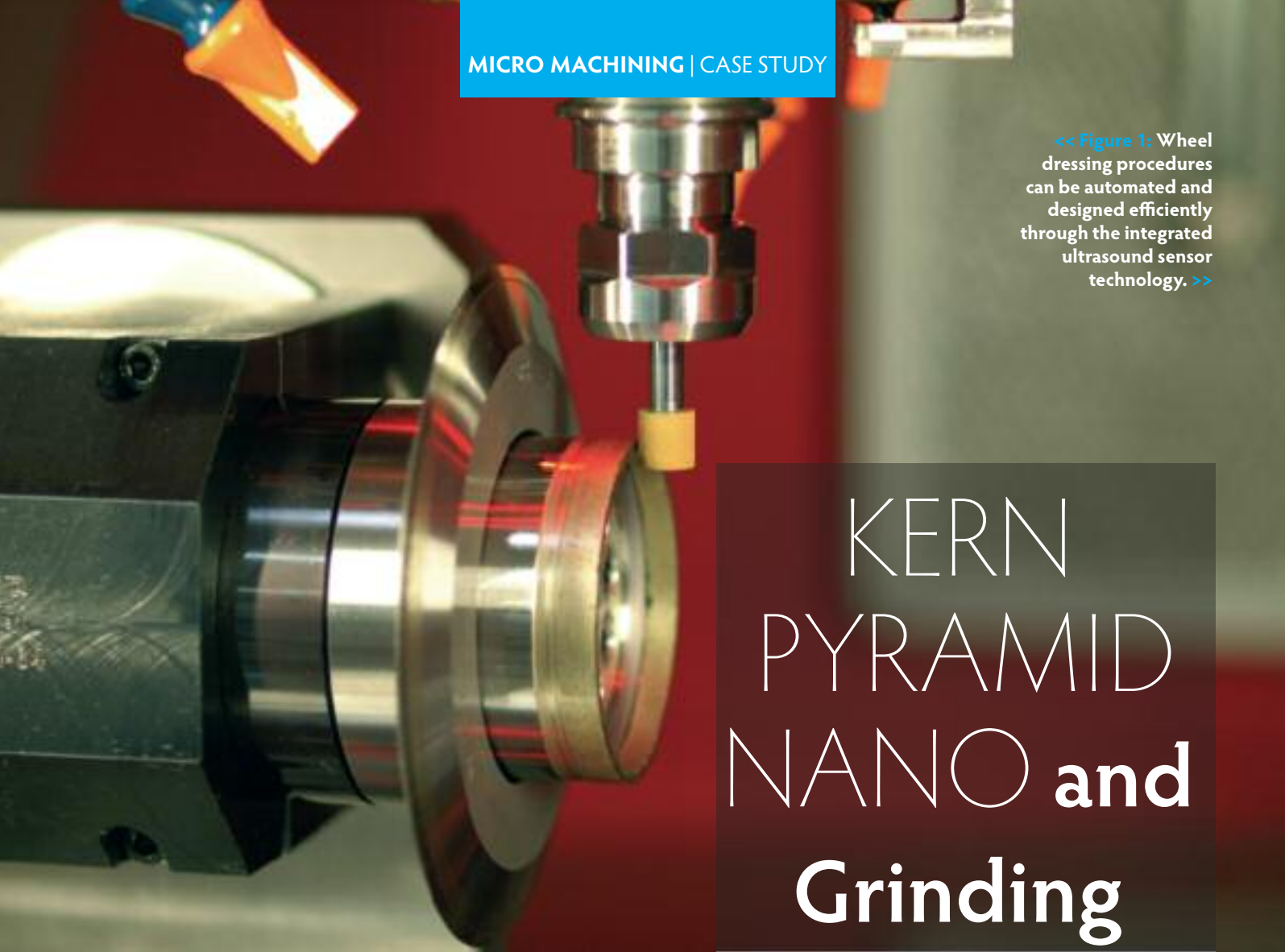
<< Figure 1: Wheel dressing procedures can be automated and designed efficiently through the integrated ultrasound sensor technology. >>