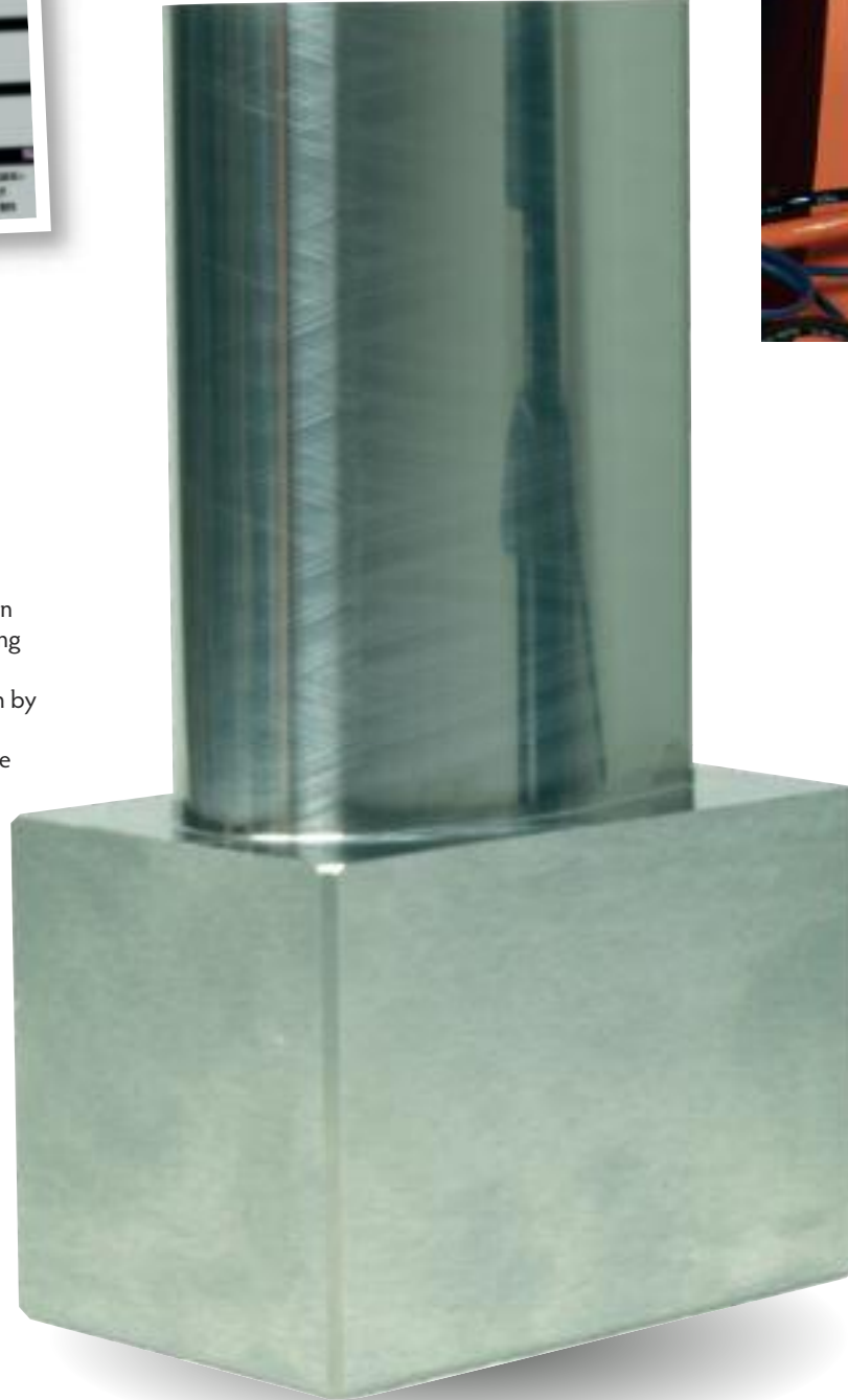
<< Figure 4: TDie that was manufactured with the help of a free X-Y profile and a superimposed pendulum stroke. The cross-grinding is clearly visible. >>

the depth dimension of the air bearing pocket with respect to the top surface. With the help of the ultrasound sensor technology it is possible to fully automatically determine the position of the top surface with a precision of less than 0.5 µm in order to achieve a subsequently repeatable and stable process on the component.